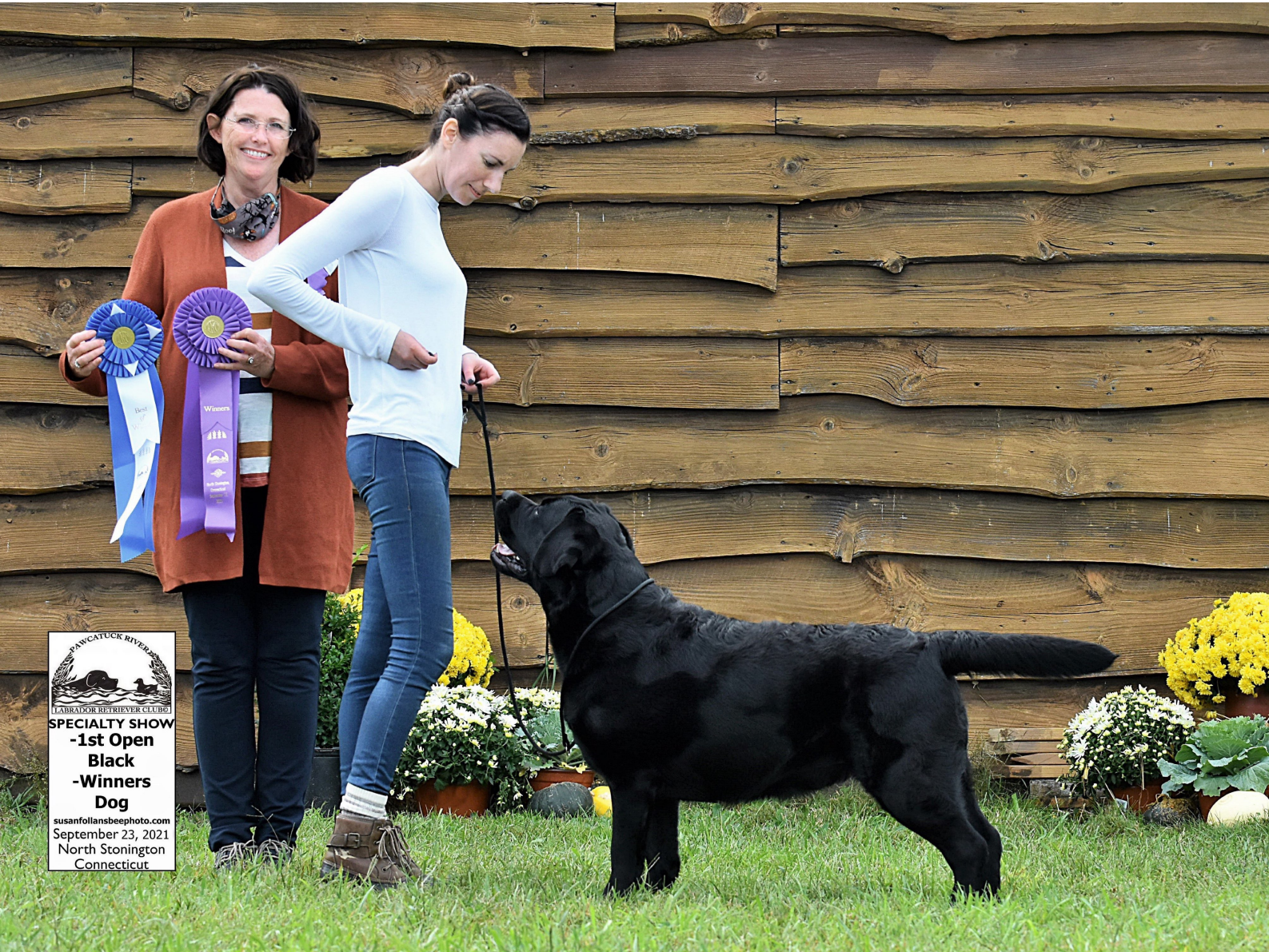
PAWCATUCK RIVER LABRADOR RETRIEVER CLUB SPECIALTY SHOW -1st Open Black -Winners Dog September 23, 2021 North Stonington Connecticut